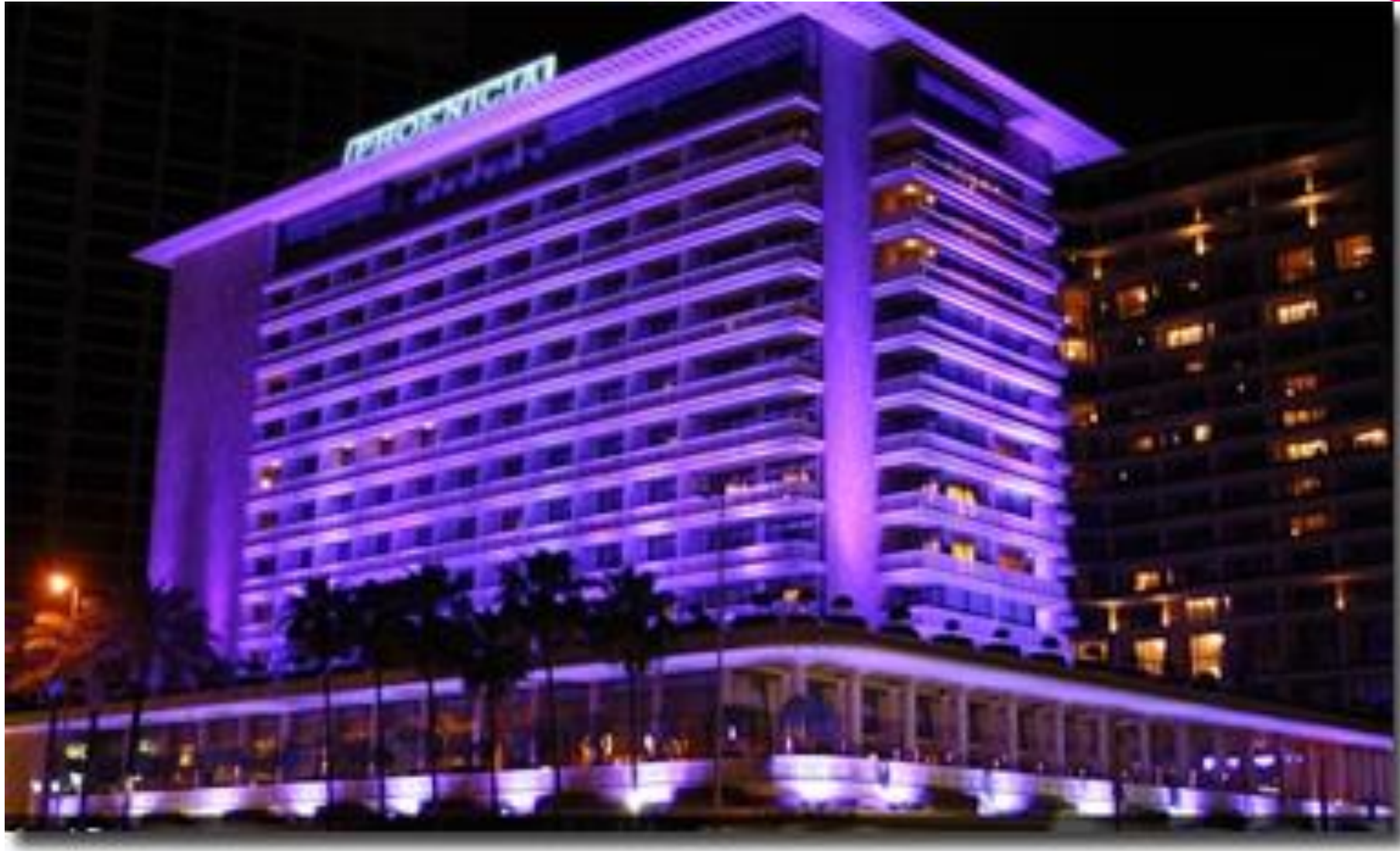
World Summit on Accessible Tourism - Brussels 1-2 October 2018