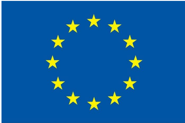
Project funded by the European Union