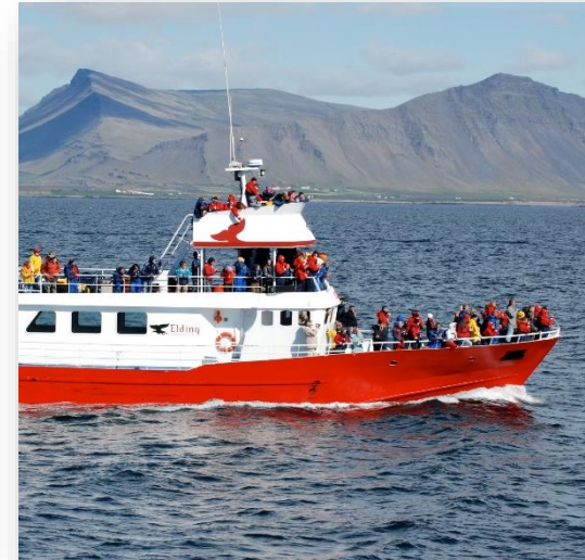
Boating Tourism Operators