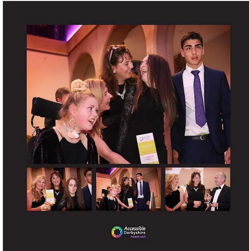
Accessible Derbyshire Awards at Chatsworth House