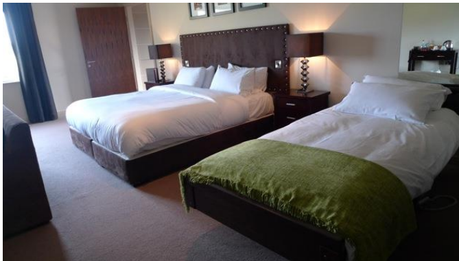
Electric profiling beds