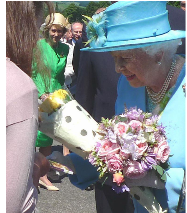
Meeting the Queen