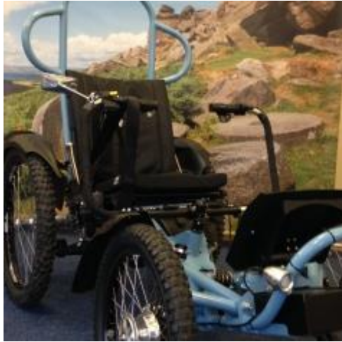
'All – Terrain' wheelchair