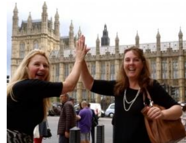
World Summit on Accessible Tourism - Brussels 1-2 October 2018