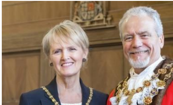
Support from our Mayor