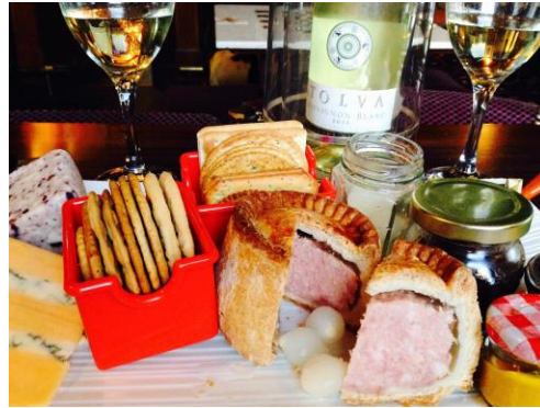
Food and Drink