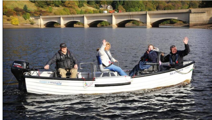
Wheelchair accessible boat