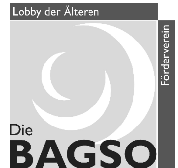
Picture: BAGSO Logo