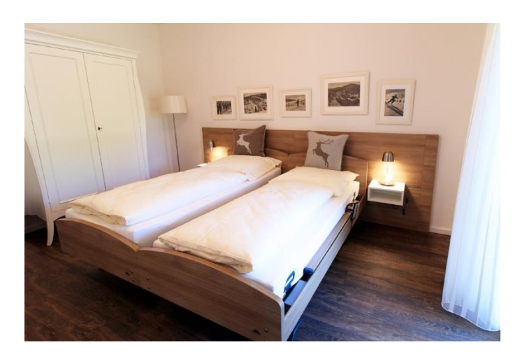
Bedroom with a nursing bed