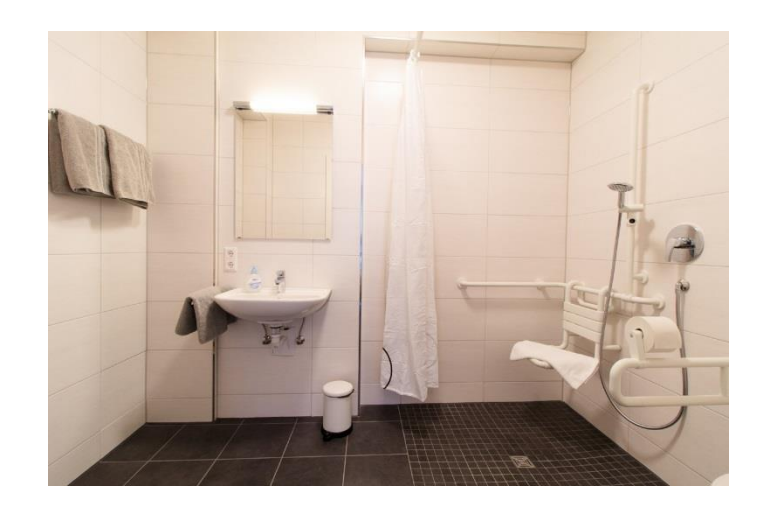
barrier-free bathroom with shower